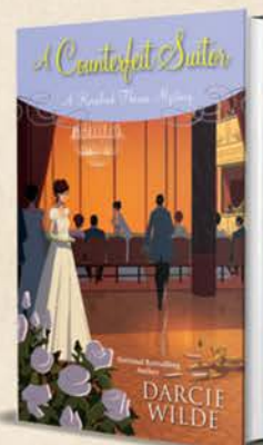
A COUNTERFEIT SUITOR ISBN: 9781496720887