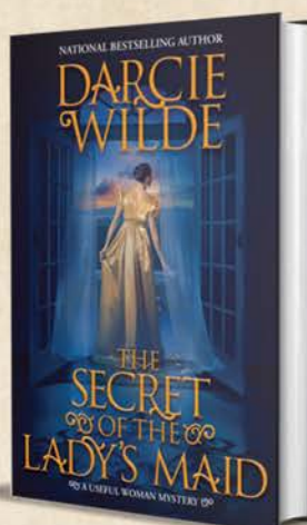
THE SECRET OF THE LADY'S MAID ISBN: 9781496738035