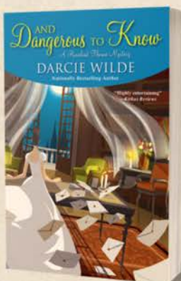
AND DANGEROUS TO KNOW ISBN: 9781496720894