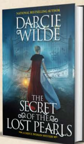
THE SECRET OF THE LOST PEARLS ISBN: 9781496738011