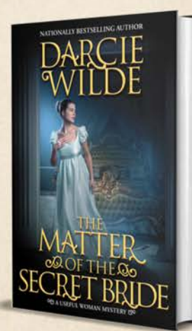
THE MATTER OF THE SECRET BRIDE ISBN: 9781496750631