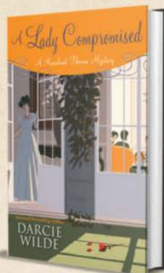
A LADY COMPROMISED ISBN: 9781496720870