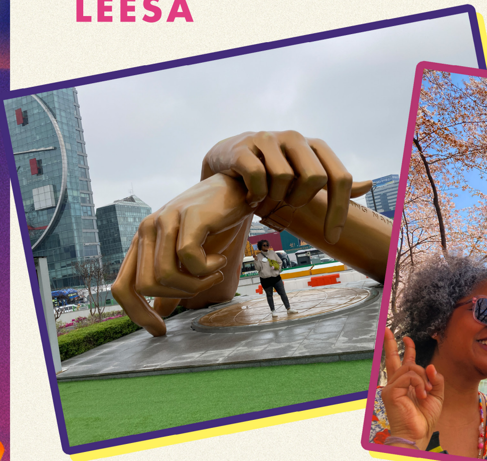
The Gangnam Style sculpture in Gangnam. Gangnam is the posh neighborhood where the girls and their host families live in the book, and the sculpture is there because of “Gangnam Style” by PSY .