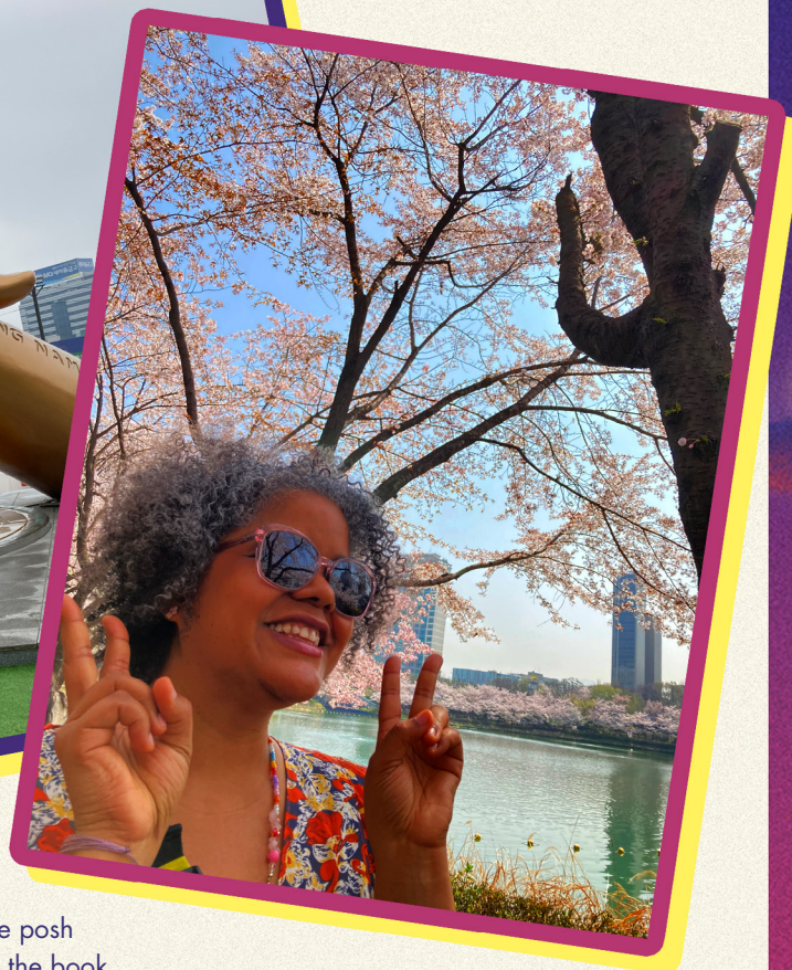
I’m in Seokchon Lake Park visiting the cherry blossoms.