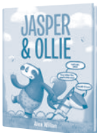
Art © 2019 by Alex Willan