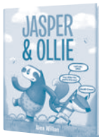
Art © 2019 by Alex Willan